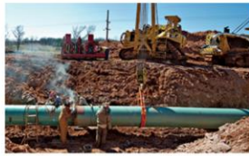
Linear Property Symposium