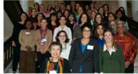
Status of Women