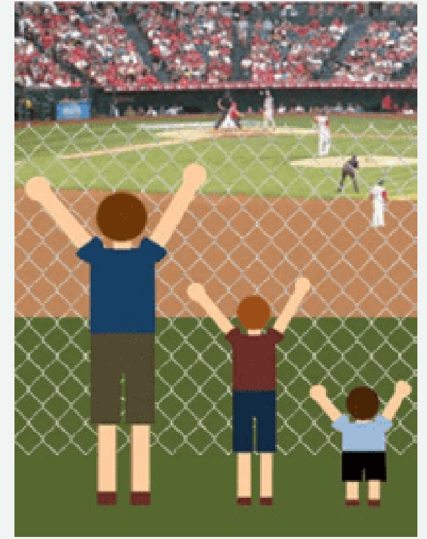
Systemic barrier is removed